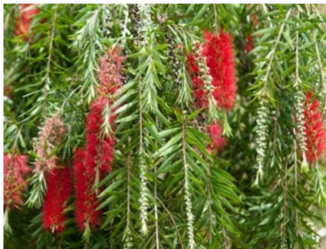
Figure 1: A red bottlebrush plant.

particularly given the increasing challenge of drug resistance. Ongoing research aimed at identifying, isolating, and characterizing active compounds, along with thorough safety and efficacy testing, will be crucial in developing effective and sustainable anthelmintic treatments. Combining traditional knowledge with modern scientific methodologies has the potential to significantly improve global health outcomes in the fight against helminth infections.