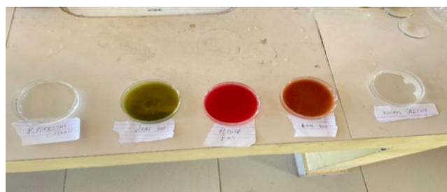
Figure 5: Standard drug, plant's materials and Normal. Saline are taken accordingly in different petri dishes.