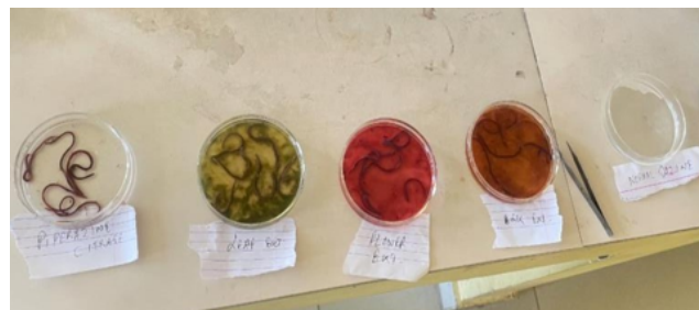
Figure 6: In vitro anthelmintic assay.