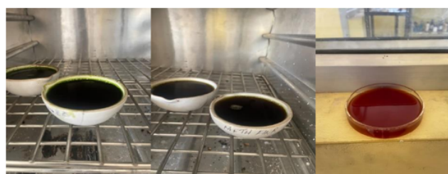
Figure 4: a) Collected extract of leaf b) Collected extract of flower. c) Collected extract of Bark.

and stored in a dark place away from sunlight for further use. A suitable option will be concentration of the extract, if superior activity is desired of the active compounds. This stage can be achieved by either distillation under atmospheric pressure or using gentle heating so that the significant components do not degrade. 8,9