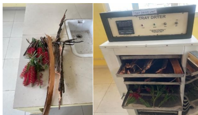
Figure 2: Collection and drying of plant material in a tray dryer.

The plant materials were washed properly and shade dried at room temperature for 5 to 6 days, and after that it is dried further inside the tray dryer at 60°C to eliminate the remaining moisture on the leaves, flower and the bark. Now the dried flower, leaves and bark were powdered into coarse grain particles using blender machine and were stored separately in compartments respectively.