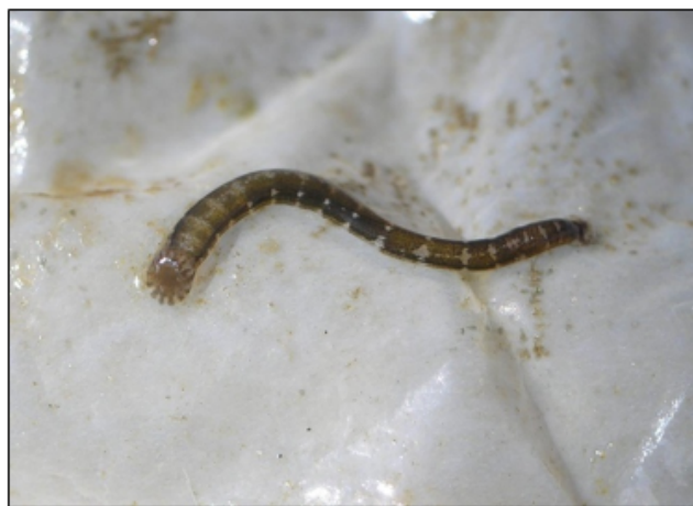
Figure 1: Piscicola geometra .

The Department of Biotechnology at Assam Down Town University's Faculty of Science gathered 800 leeches that were 1.27 \pm 0.44 cm long. The most common ways to identify a Piscicola geometra species were by looking at its distinctive bell-shaped anterior sucker, cylindrical body, and transparent segments adorned with white dots throughout the length of its body (Figure 1).