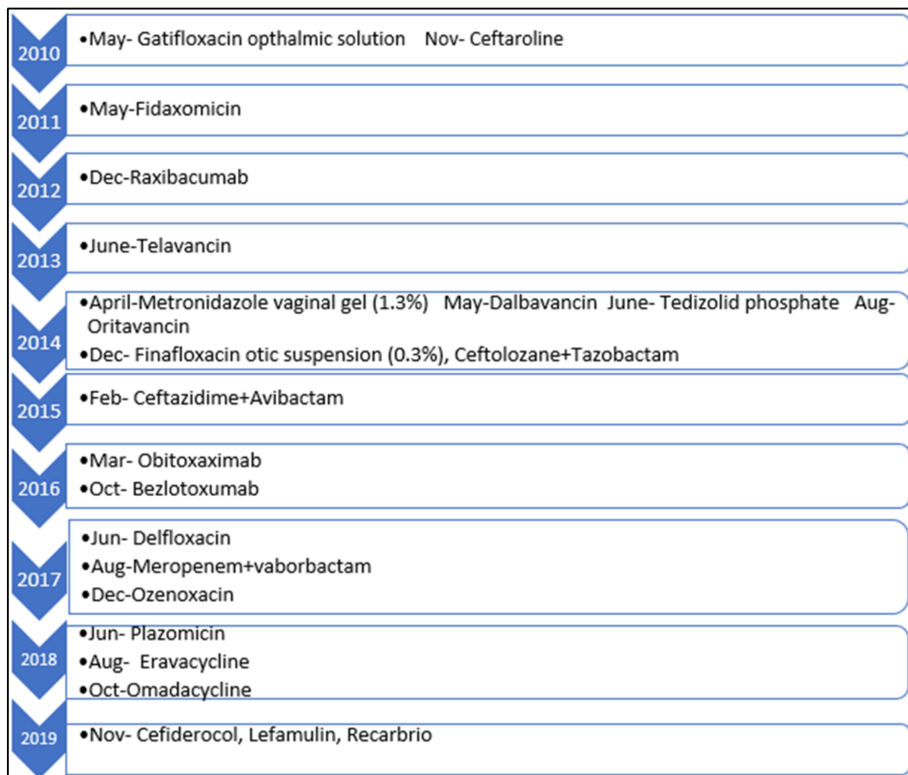
Fig. 1: Timeline of FDA approval of antibiotics in the past 10 years