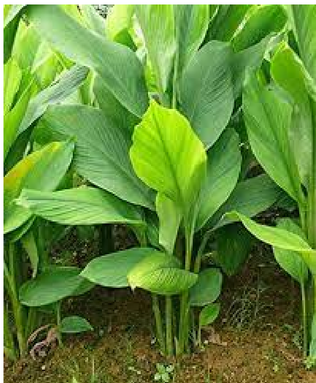
Figure 1: Curcumin