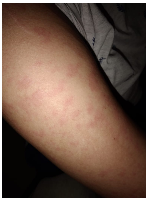
Fig. 3: Rashes and pruritus on lower extremities

The rashes gradually progressed to arm and trunk region by 6:00 PM. On Examination, Blood pressure, pulse rate was normal. Anti-histaminic treatments were given at the local OPD. The event subsided thereafter. The next day at 12:00 PM, again the rashes reappeared with itching and redness over upper and lower extremities. By 9:00 PM, at night, the rashes spread to her face with sensation of burning and pruritus. Patient was rushed to hospital, where she was given Inj. Hydrocortisone 100 mg STAT, Inj. Chlorpheniramine maleate 10 mg/ml. Emergency discharge treatment included Tab Levocitrizine 5 mg once a day at bed time for 2 days.