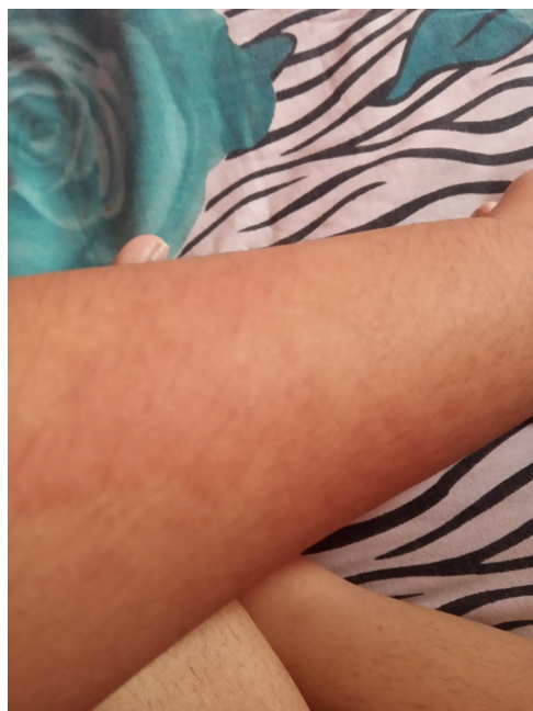
Fig. 2: Rashes on arms