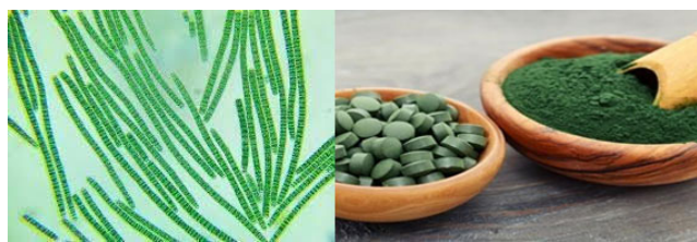
Fig. 1: Spirulina plantensis powder

Both in vivo and in vitro trials have shown effective and promising results in the treatment of certain cancers and allergies, anemia, hepatotoxicity, viral infection, vascular diseases, radiation protection, and obesity. The antioxidant activities of Spirulina were demonstrated in a large number of preclinical studies. Antioxidant drugs and foods are used in prevention of many human diseases. Findings of this study showed Spirulina can be used a source of antioxidants.